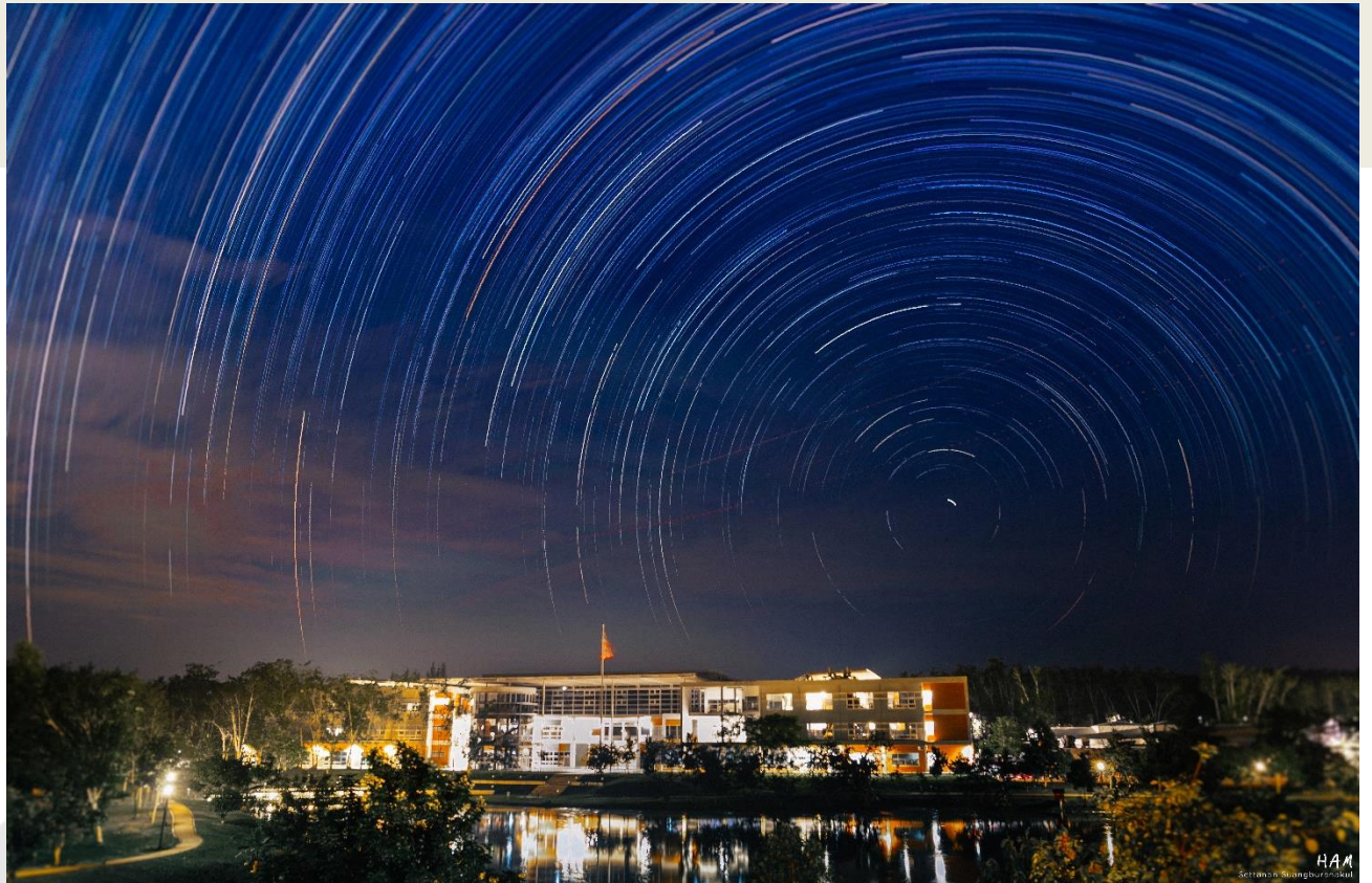
Main Building at Night.